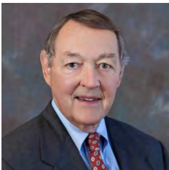
Jim Gibbs Five States Energy Capital